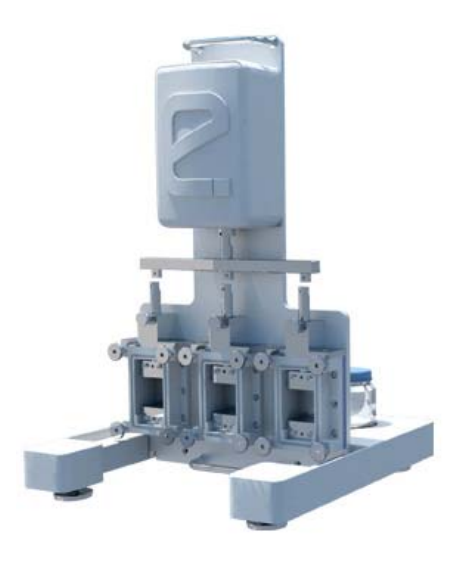
Figure 1. TC-3 bioreactor

The most prevalent approach to cartilage tissue engineering involves the combination of chondrocytes (or mesenchymal progenitor cells) with scaffolds (fibrous meshes or hydrogels) for long-term culture. The adoption of a suitable culture system for chondrocytes is critical, since, for example, chondrocytes have been shown to lose their phenotype in monolayer culture after being passaged. Nevertheless, chondrocytes are able to proliferate in three-dimensional culture system without phenotype loss.