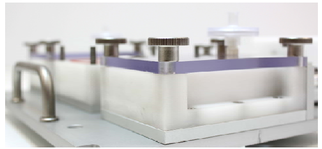
Figure 2. TC-3 chambers

The TC-3 is computer operated by a simple control software that allows the user to create complex loading profiles to be applied on the culture samples.